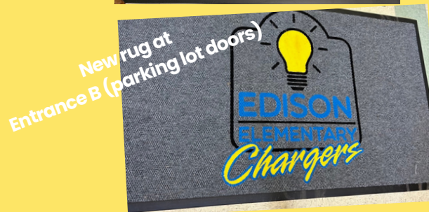
New rug at Entrance B (parking lot doors)