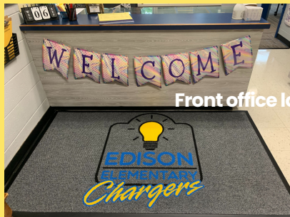
Front office logo rug