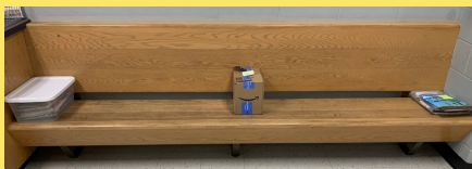
New cushion for the office bench